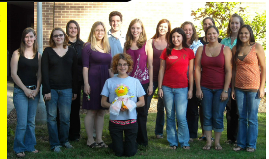
Duck lab members, Fall 2008

We would like to thank you for participating in our research over the past year! With your help, we have tested hundreds of children both in our laboratory and in the community. Your support has enabled us to learn more about children's social, emotional and cognitive development with the goal of enhancing their daily lives (e.g., in the home; at school).